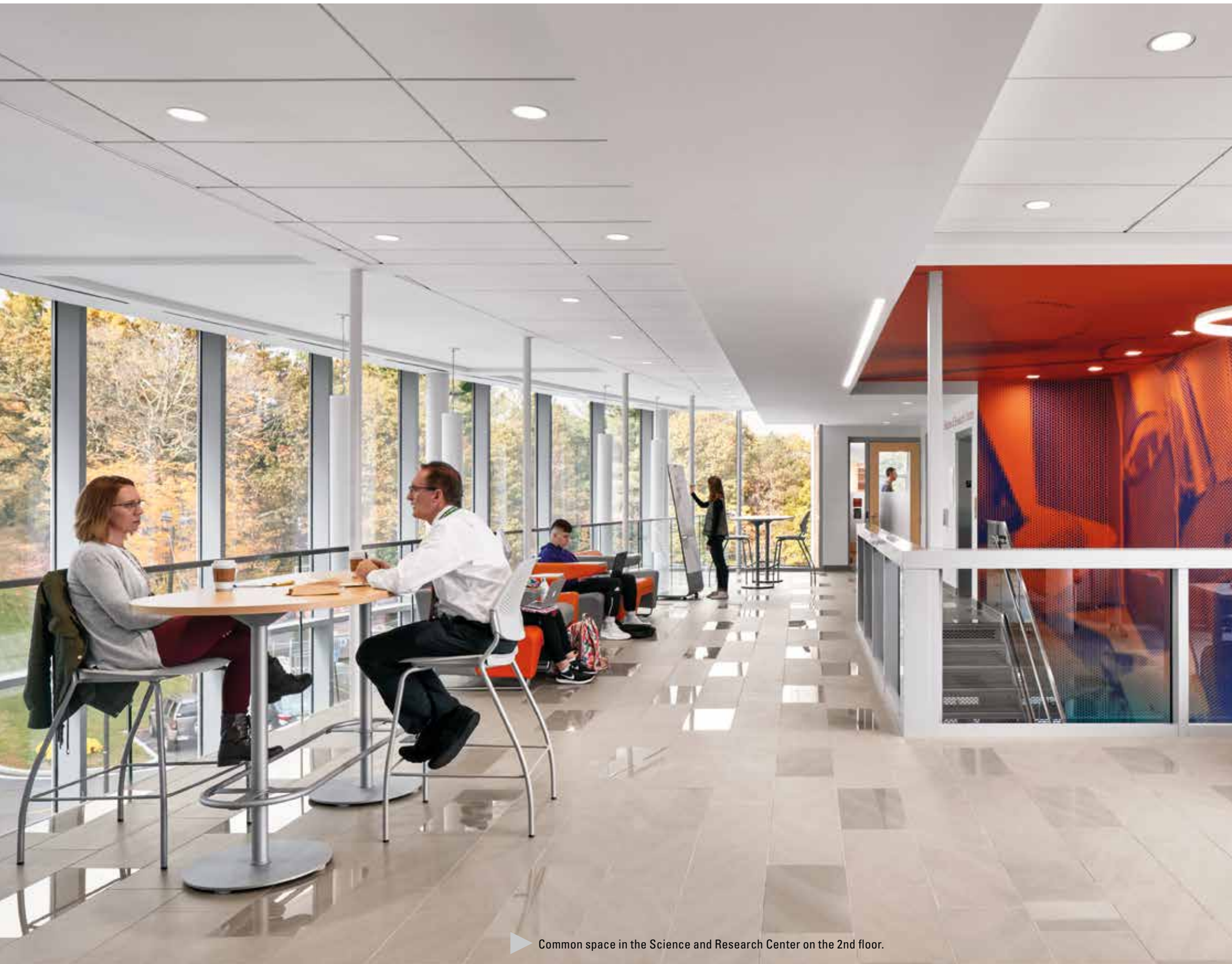
▶ Common space in the Science and Research Center on the 2nd floor.