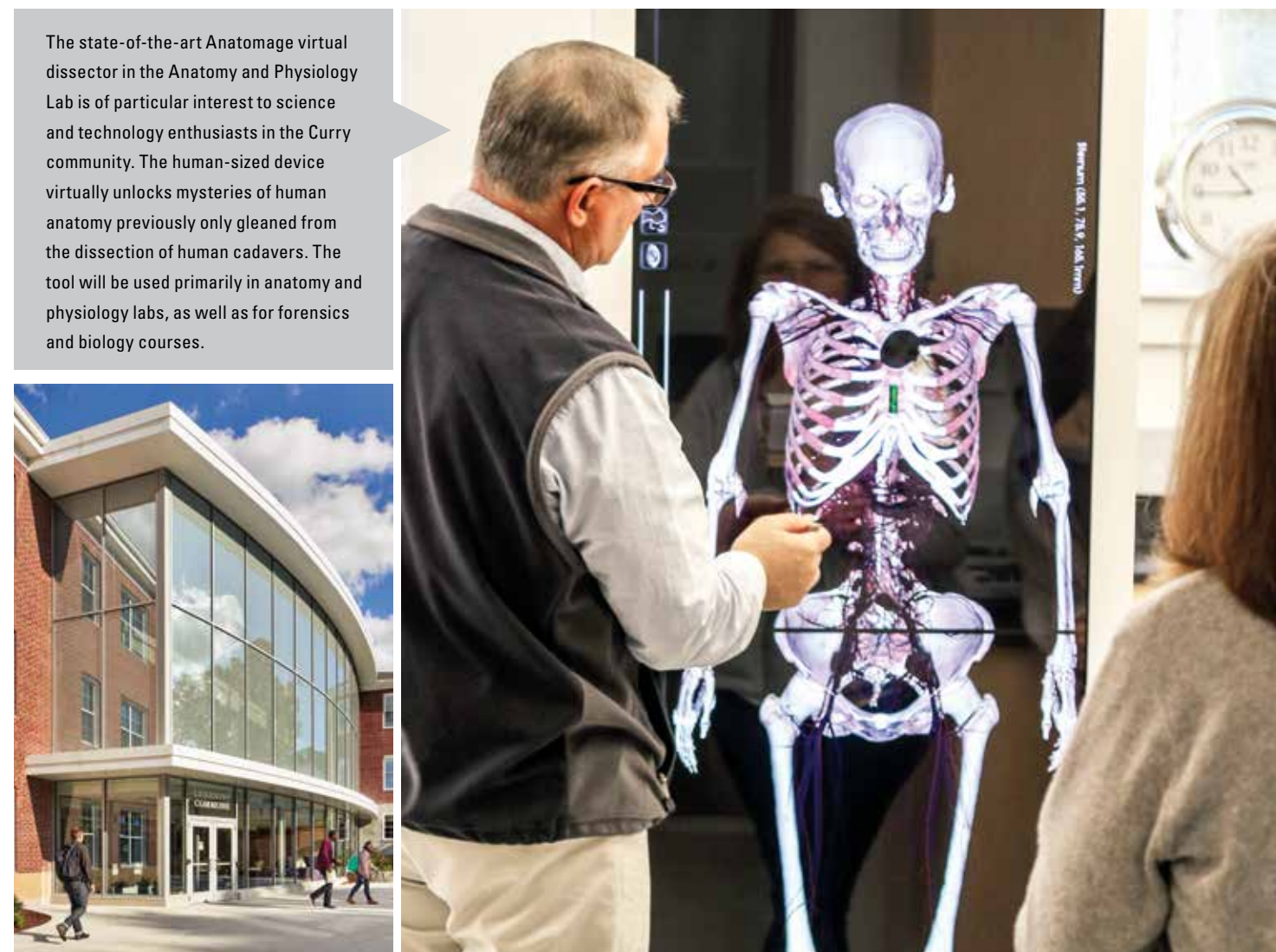
The state-of-the-art Anatomage virtual dissector in the Anatomy and Physiology Lab is of particular interest to science and technology enthusiasts in the Curry community. The human-sized device virtually unlocks mysteries of human anatomy previously only gleaned from the dissection of human cadavers. The tool will be used primarily in anatomy and physiology labs, as well as for forensics and biology courses.