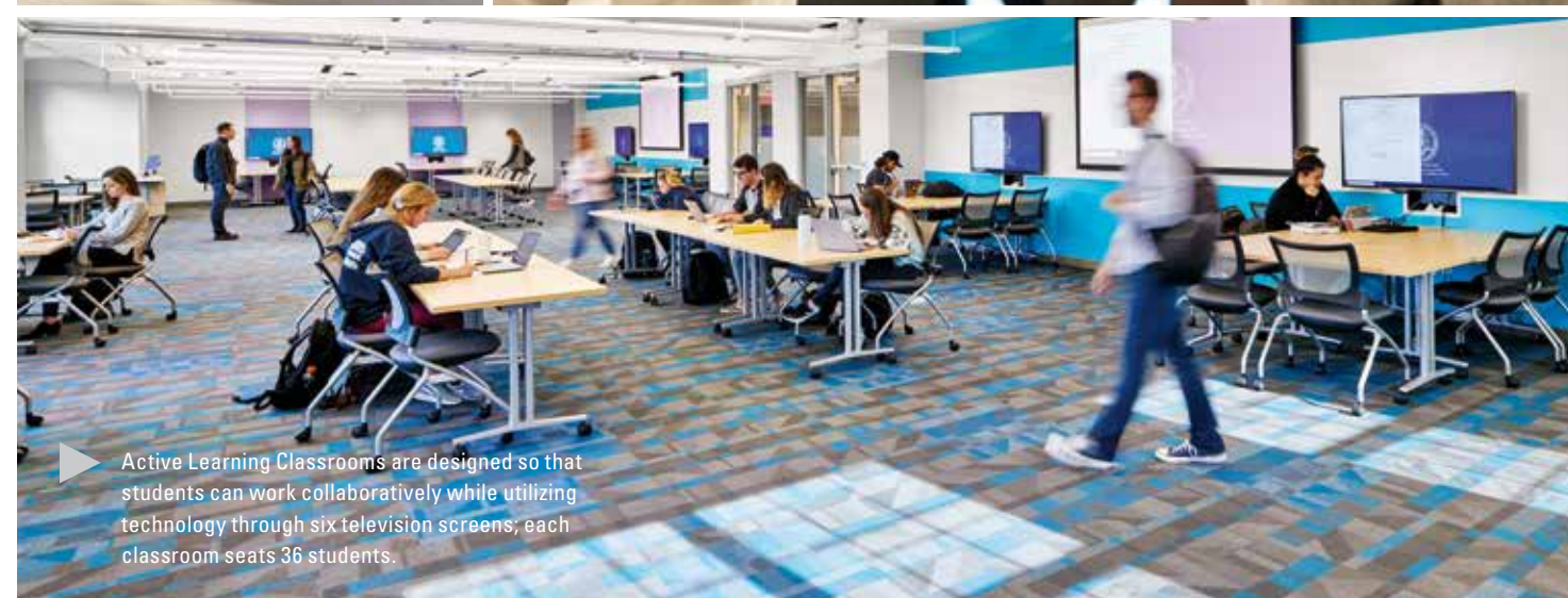
Active Learning Classrooms are designed so that students can work collaboratively while utilizing technology through six television screens; each classroom seats 36 students.