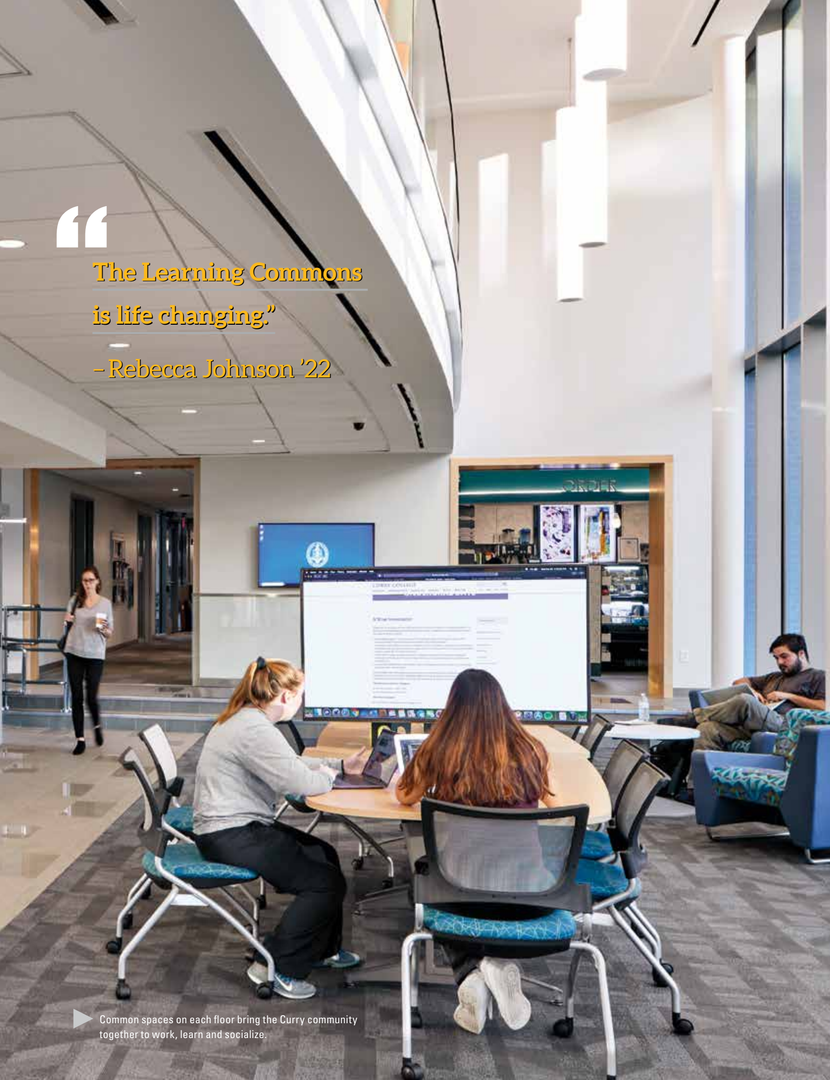
▶ Common spaces on each floor bring the Curry community together to work, learn and socialize.