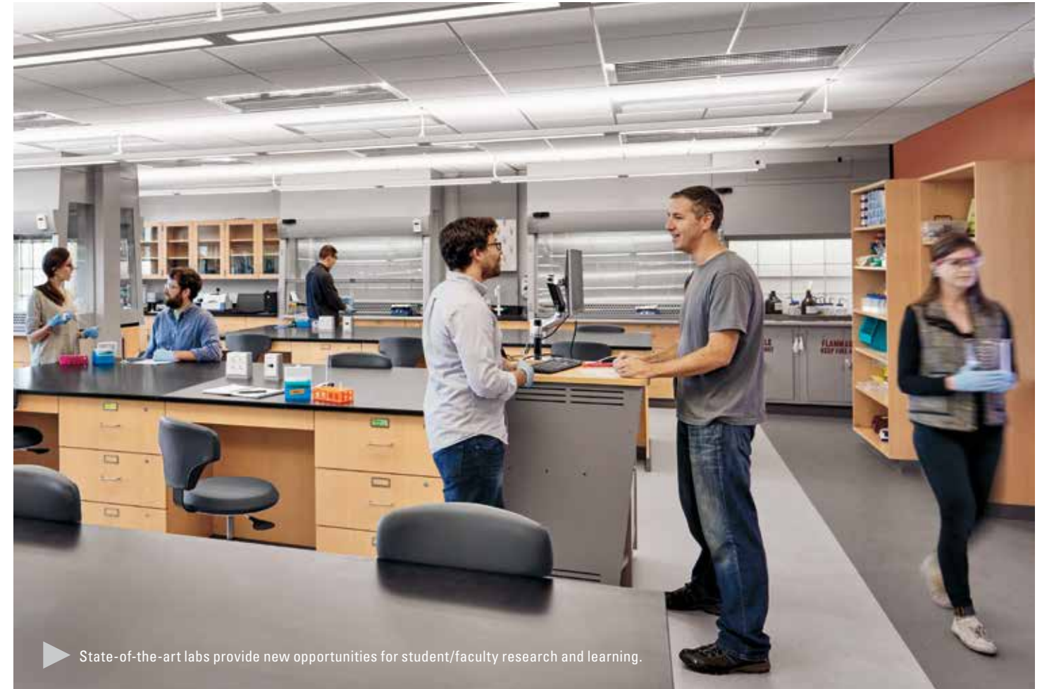
▶ State-of-the-art labs provide new opportunities for student/faculty research and learning.